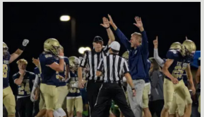
Congratulations Varsity Football for defeating Western Boone