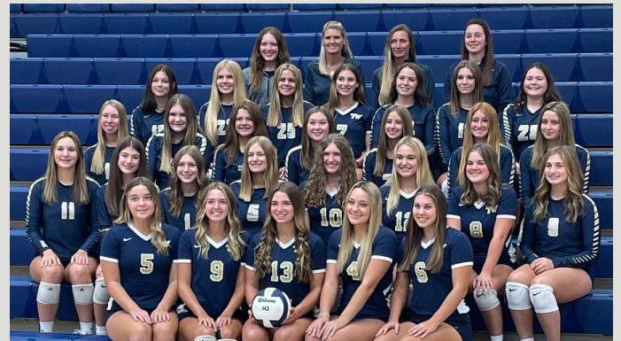
Congratulations Varsity Volleyball for defeating Southmont and Frankfort