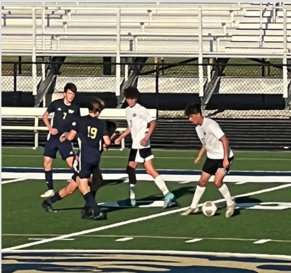
Congratulations Varsity Boys Soccer for defeating Cascade