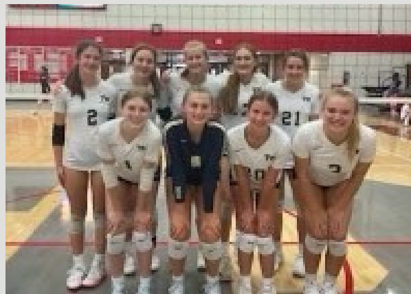
Congratulations to our JV Volleyball Team for winning the Sagamore Conference Tournament