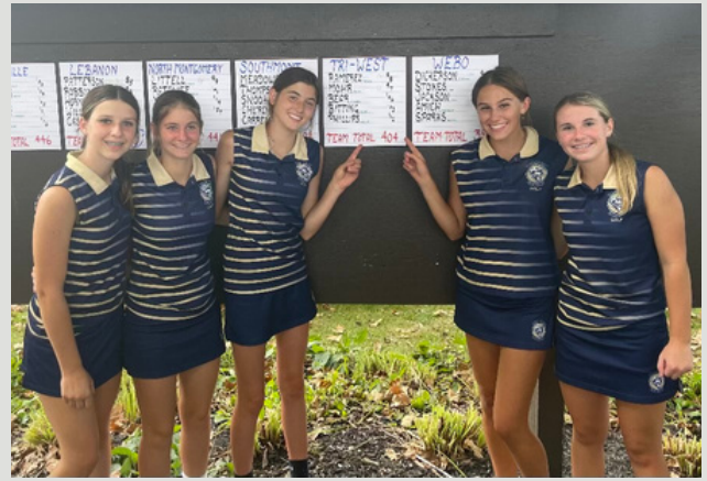
Congratulations to our Girls Golf Team for defeating Danville, Avon, and for finishing 4th in the Sagamore Conference Meet