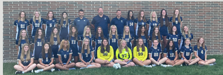
Congratulations to our Girls Varsity Soccer Team for defeating Pike