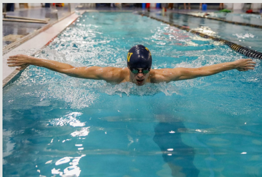
Congratulations to Boys Swimming for defeating Speedway