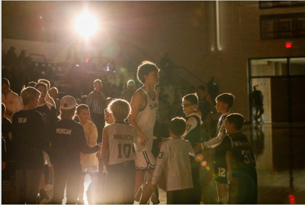
Congratulations to Boys Basketball for defeating Frankfort and West Lafayette