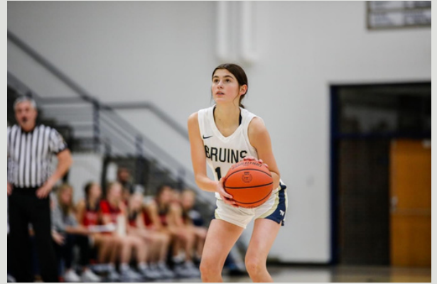
Congratulations to Girls Basketball for defeating North Montgomery and Frankfort