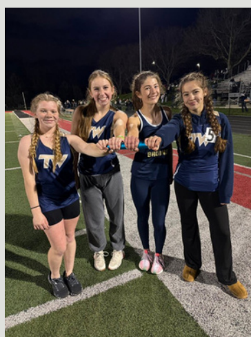
Congratulations to Girls Track & Field for defeating Southmont