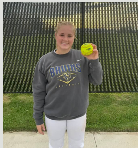
Congratulations to Varsity Softball for defeating Crawfordsville (2x), Plainfield, Cascade, and Western Boone