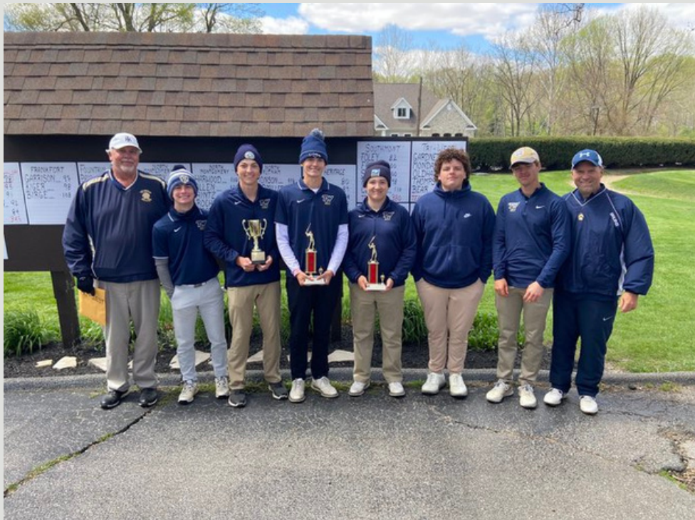
Congratulations to Boys Golf for defeating Bethesda and Cascade, and winning the Mountie Invitational