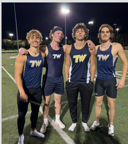
Congratulations to Boys Track & Field for defeating Metropolitan and North Putnam