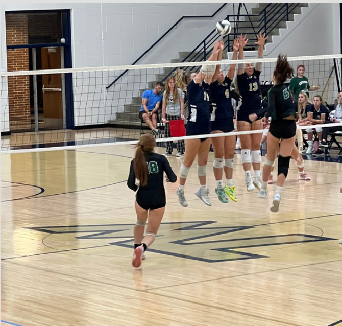
Congratulations Varsity Volleyball for defeating Covenant Christian