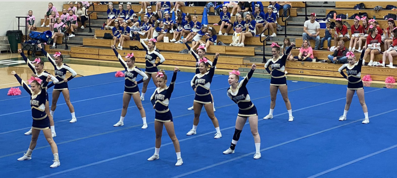
Congratulations Competition Cheer for winning the Pendleton Invitational