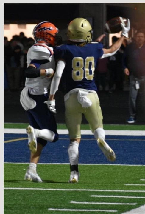
Congratulations to Varsity Football for defeating North Montgomery on Homecoming