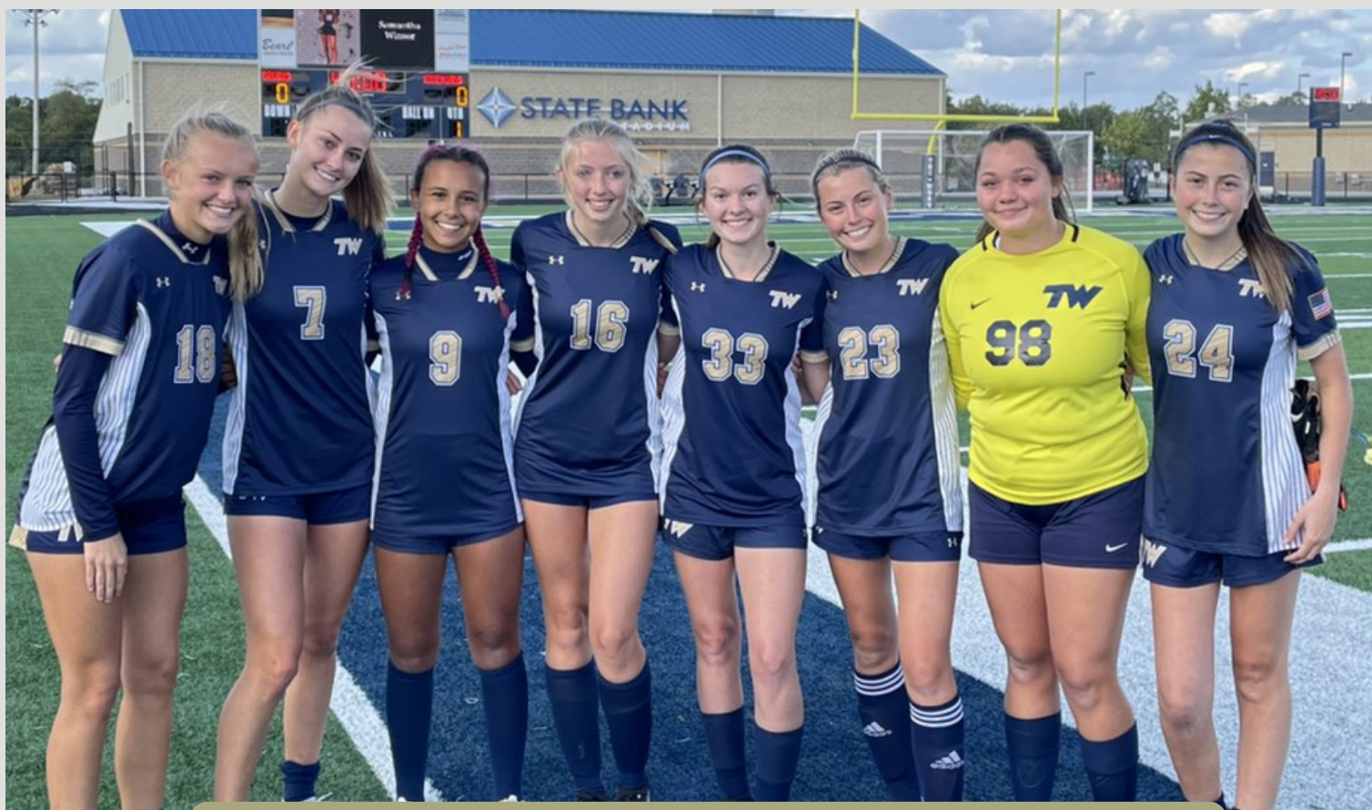
Congratulations to Girls Varsity Soccer for defeating Crawfordsville and McCutcheon