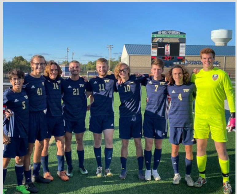
Congratulations Varsity Boys Soccer for defeating Western Boone