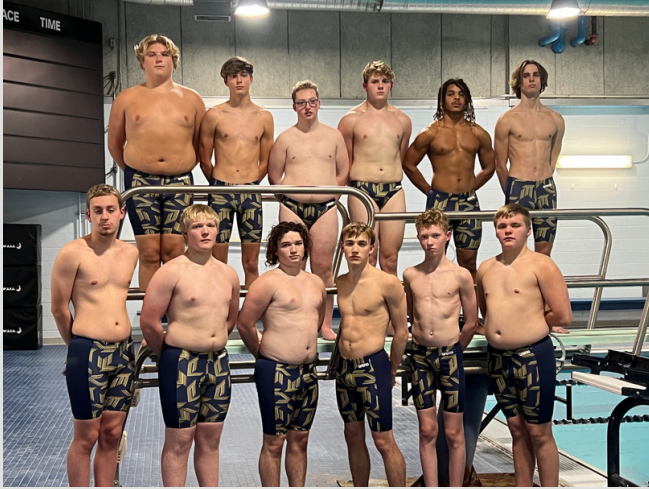
Congratulations to our Boys Swimming and Diving team for defeating Frankfort