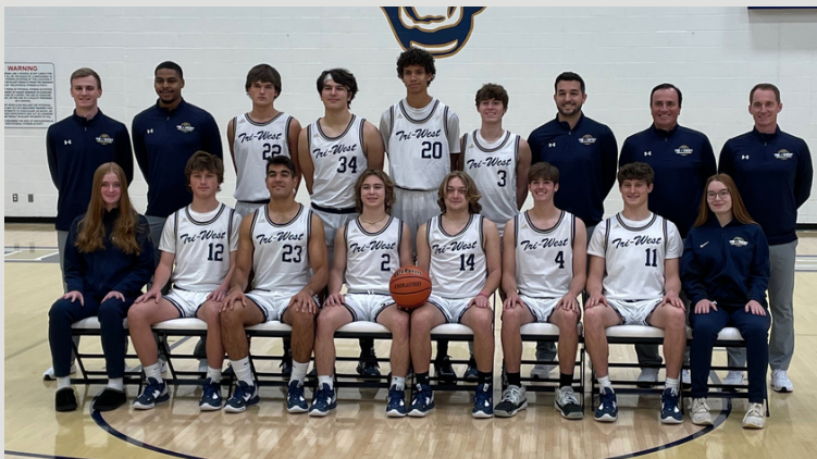
Congratulations to our Boys Basketball team for defeating Benton Central