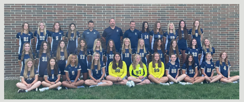
Congratulations to Girls Varsity Soccer for defeating Southmont and Lebanon