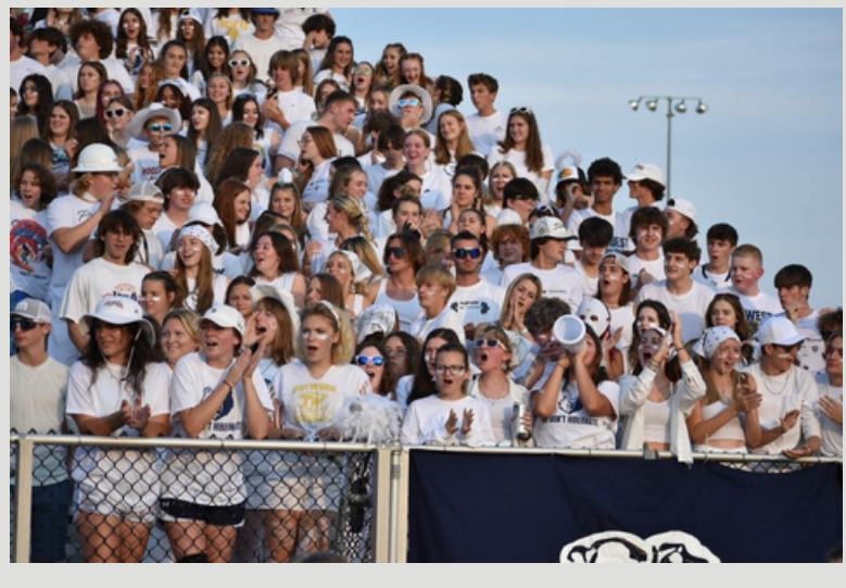
Thank you to our outstanding student section!