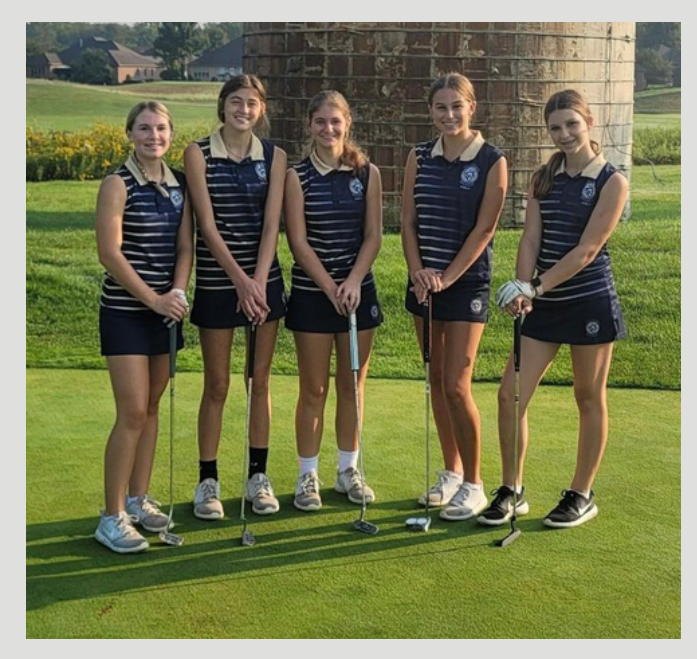
Congratulations to our Girls Golf Team for defeating North Montgomery, Fountain Central, Southmont, and for finishing 8th in the IHSAA Sectional Championship