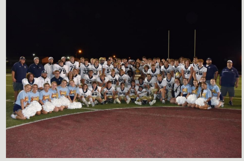
Congratulations Varsity Football for defeating Danville