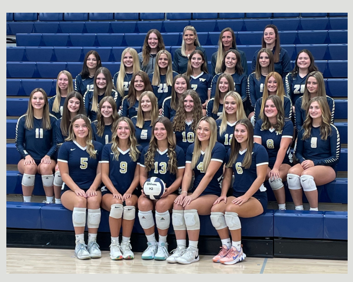
Congratulations Varsity Volleyball for defeating North Montgomery and Monrovia