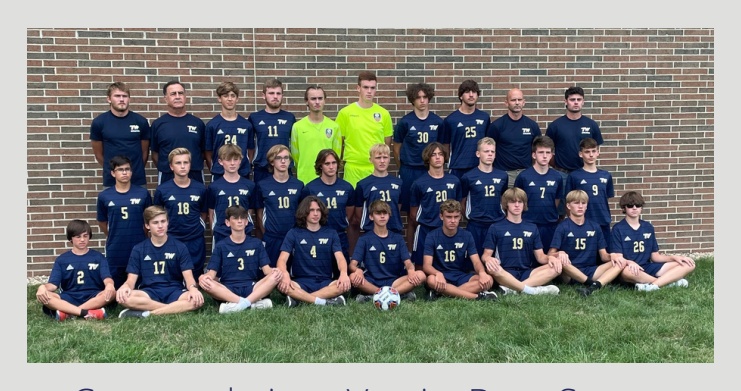
Congratulations Varsity Boys Soccer for defeating Southmont