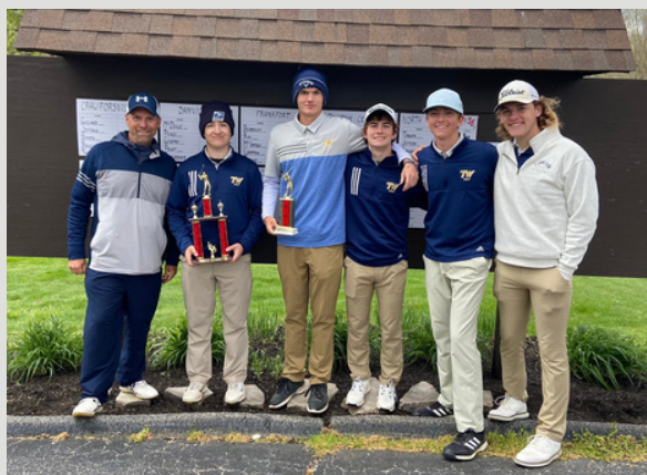
Congratulations to Boys Golf for winning the Mountie Invitational