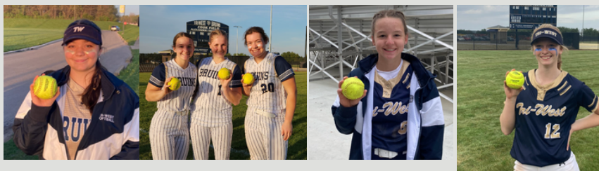
Congratulations to Varsity Softball on defeating Crawfordsville (2x), Plainfield, Cascade, and Western Boone