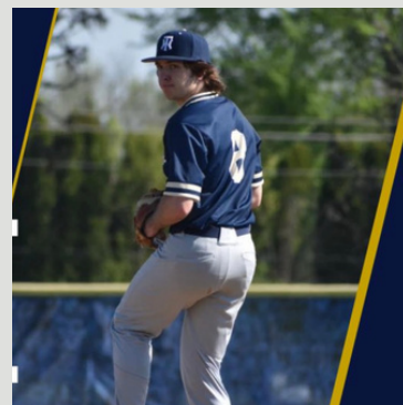
Congratulations to Varsity Baseball on defeating Crawfordsville (2x) and Western Boone