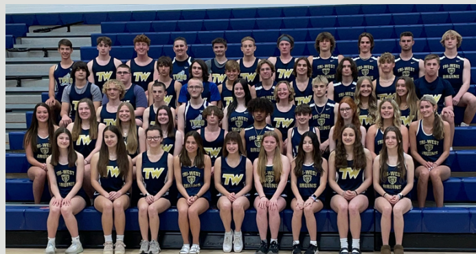
Congratulations to Boys Track & Field for defeating North Putnam