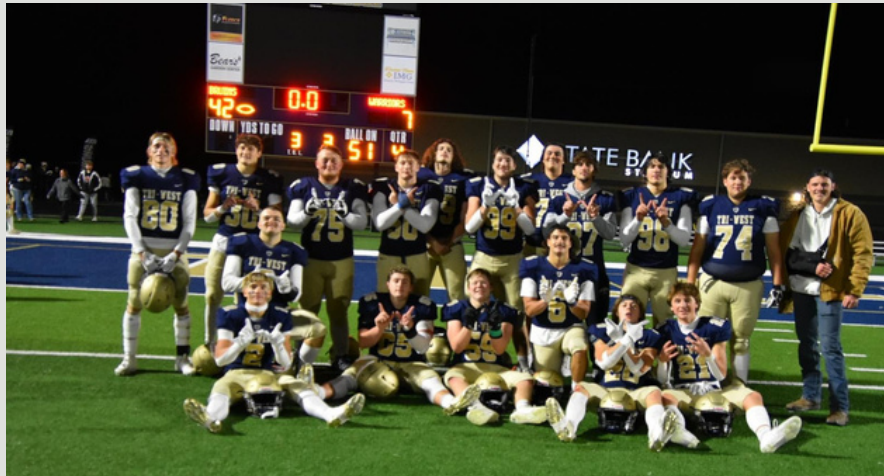
Congratulations to Varsity Football for defeating Danville in the IHSAA Sectional Round 1

Congratulations to Varsity Volleyball for defeating Speedway and Hamilton Heights to win the IHSAA Regional