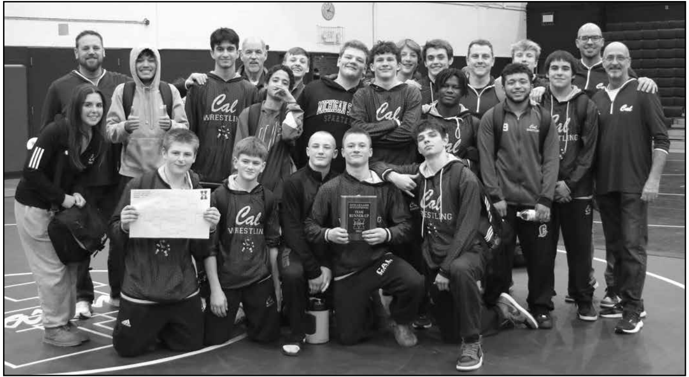
The Caledonia varsity wrestling team celebrates its Gold team’s runner-up finish Saturday, Jan. 6, at the annual L.H. Lamb Tournament at Hastings High School. There were eight Fighting Scot medalists overall from Caledonia “Gold” and “Purple” teams that competed.

The Saxon “Gold” team made it three L.H. Lamb Tournament championships in a row, since the funky Covid-influenced 2020-21 season,